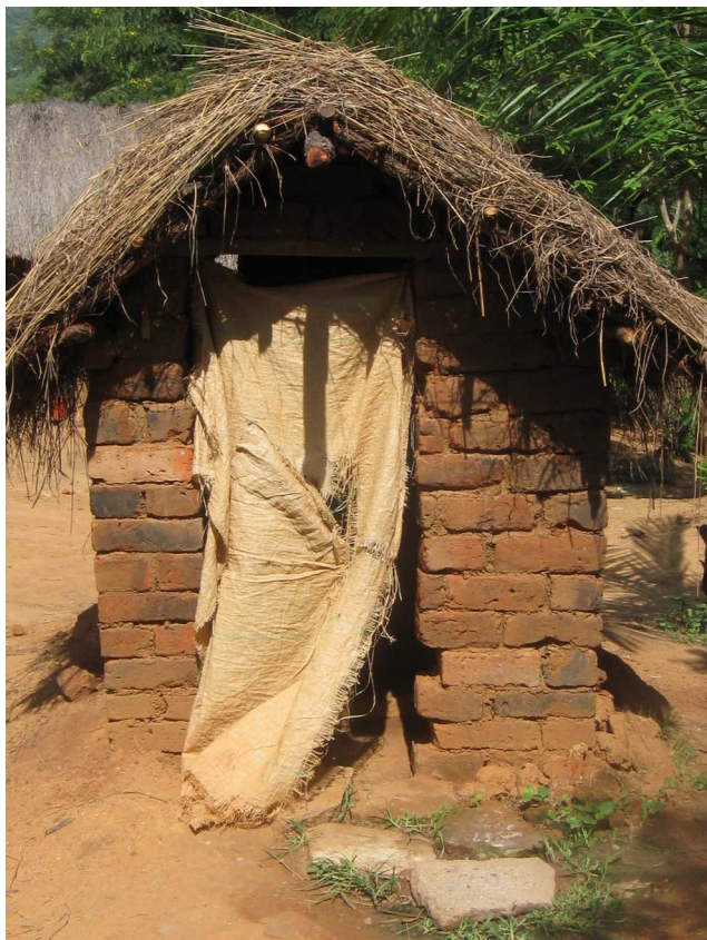
Figure 3 An improved form of sanitation: a household pit latrine in Tanzania.